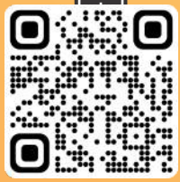
Scan for site Location